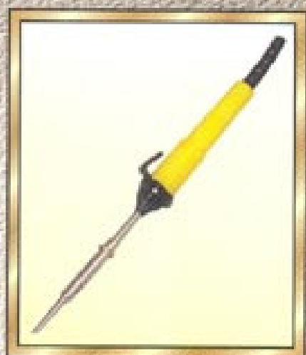
SRN 25, 35, 50