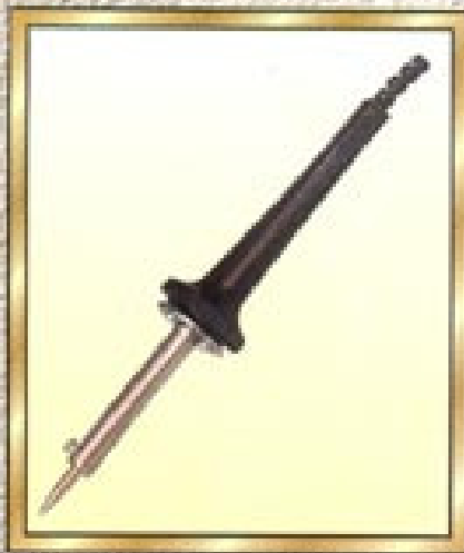
SRN 30, 40, 60,