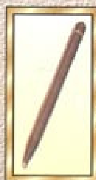
B3 Spade Tip