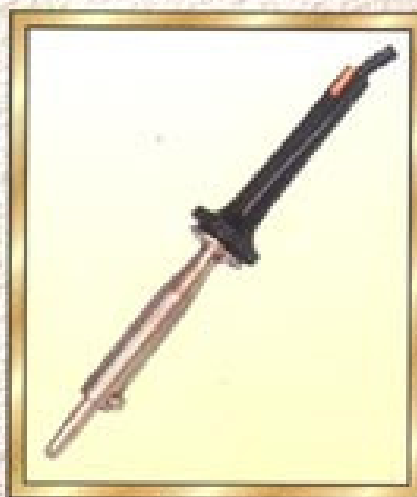
SRN 75, 100, 125,