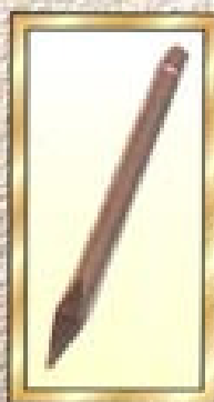
B2 Sc. Driver Tip