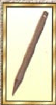
B1 Pointed Tip