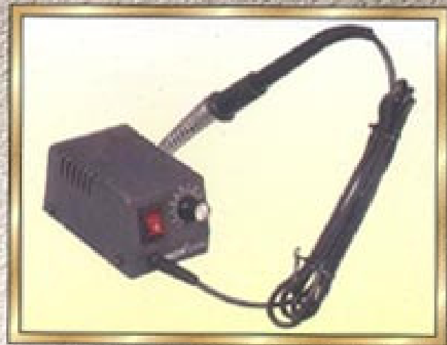
MICRO SOLDERING STATION